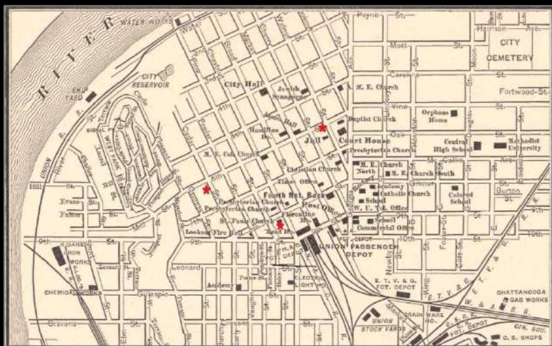
The City of Chattanooga - 1892

They rented an apartment at 506 West 6 th Street Chattanooga TN and the 1900 Census reports show a Carry Ashcraft (22) and Alfred Hamerk (25) as boarders. His office was located on Cherry Street just a few blocks away. Due to the more than fifty-four different floods that occurred in Chattanooga between 1874-1937, most buildings and streets in this neighborhood close to the river no longer exist!